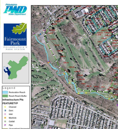
Cobbs Creek Stream Restoration Phase 1: Cobbs Creek Golf Course - Reach 1